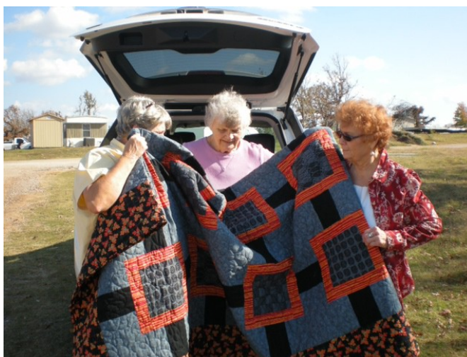
Oklahoma Women Receive Quilt